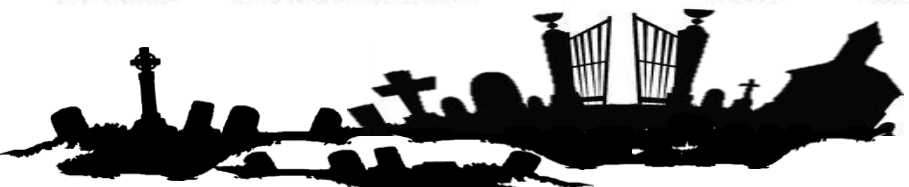
A Midnight Ride